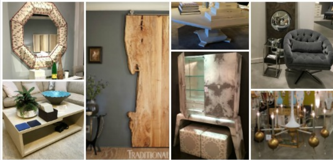
Clockwise from upper left photos courtesy of: Vanguard via Sweet Peas Design, traditionalhome.com, Kravet via Sweet Peas Design, Vanguard via Sweet Peas Design, Louise Gaskill via Sweet Peas Design, emporiumhome.com