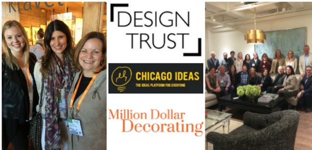
From upper left photos courtesy of: Sweet Peas Design, Design Trust, chicagoideas.com, milliondollardecorating.com, Sweet Peas Design