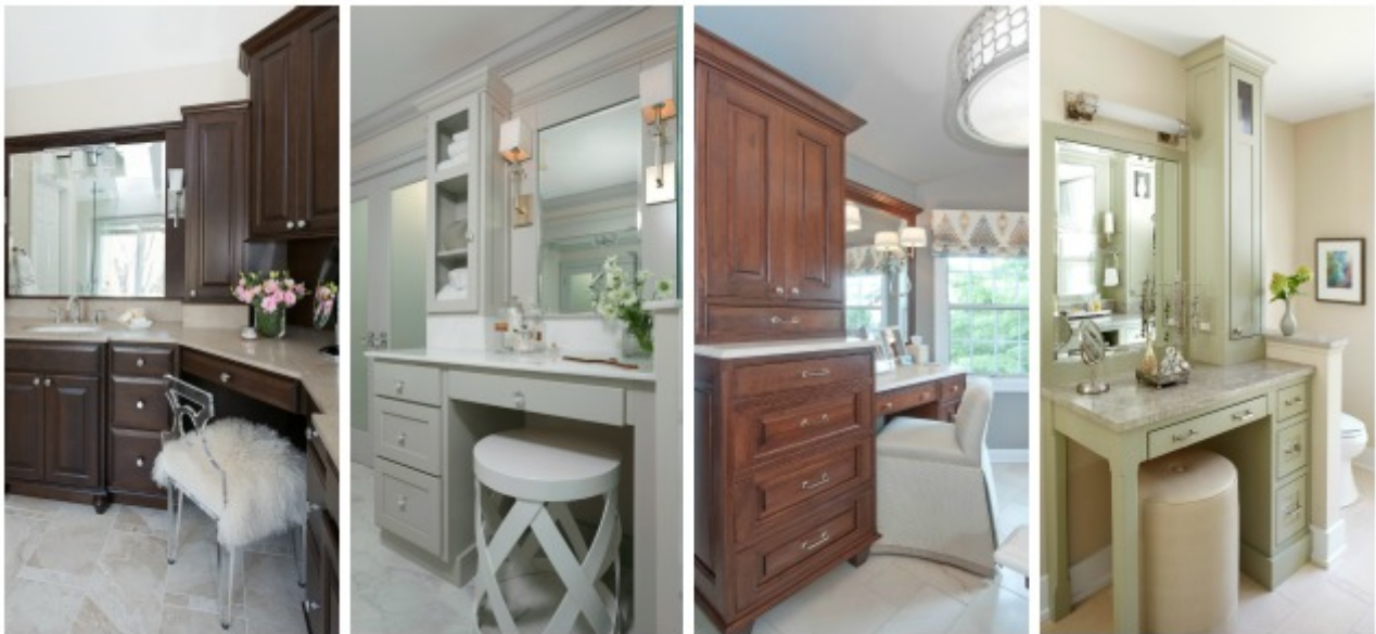
> projects by Sweet Peas Design and